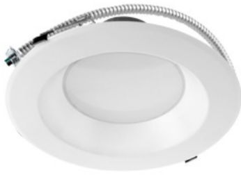
SELECTABLE WATTAGE & CCT